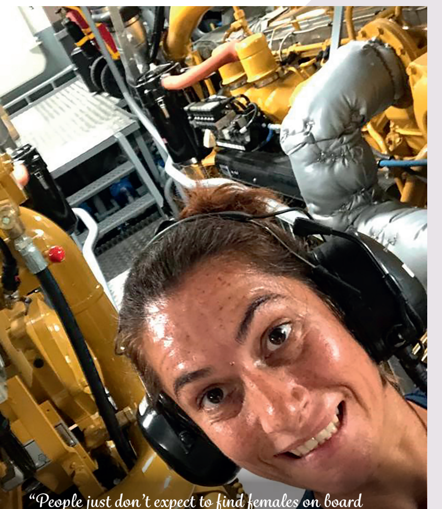
"People just don't expect to find females on board who know all about the technical systems."

"After many years in the French Merchant Navy I was ready for a new challenge, but I knew it needed to involve the sea. When an opportunity arose to work on a 60-metre superyacht as a Second Engineer I grabbed it straight away. Luxury yachting was a complete new world for me but the work I do on board remains the same. People are certainly more used to see women on board yachts than on board commercial vessels but seeing females in Engineering roles still remains unusual in both industries. A lot of people just don't expect to find females on board who know all about the technical systems, the propulsion, power management, air-conditioning, water production and treatment, AV/IT and water toys and tenders! I am often told, by chandlers, agents and suppliers, that I am the first female Chief Engineer on yacht."