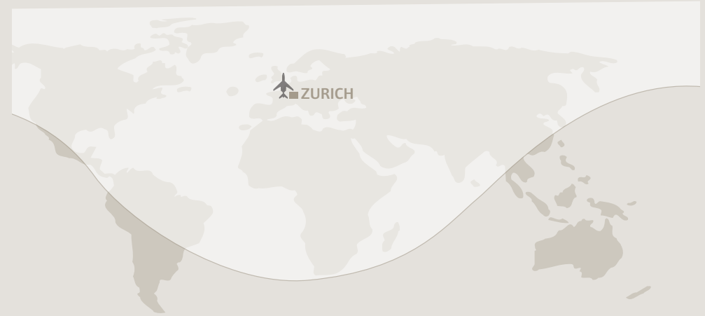
GLOBAL 5000 RANGE OUT OF ZURICH

This map is a schematic representation only.