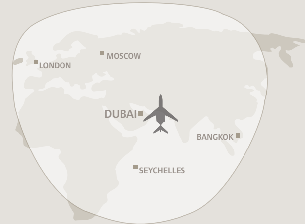
LINEAGE 1000 RANGE OUT OF DUBAI

This map is a schematic representation only.