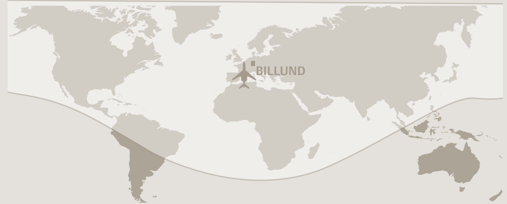
FALCON 7X RANGE OUT OF BILLUND

This map is a schematic representation only.