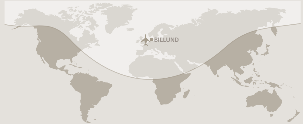
FALCON 2000S RANGE OUT OF BILLUND

*based on average winds from doors shut to doors open