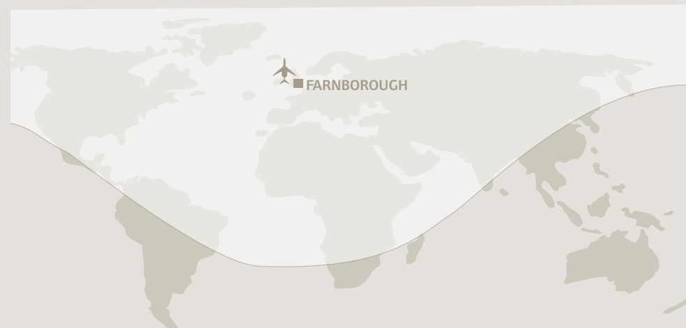
GLOBAL 5000 RANGE OUT OF FARNBOROUGH

This map is a schematic representation only.