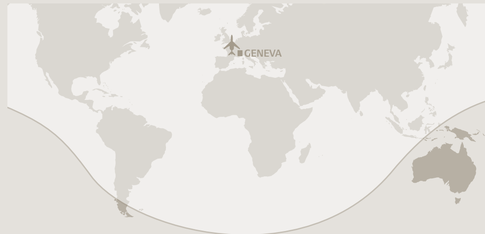
GULFSTREAM G650 RANGE OUT OF GENEVA

This map is a schematic representation only.