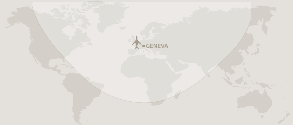
FALCON 900LX RANGE OUT OF GENEVA

*based on average winds from doors shut to doors open