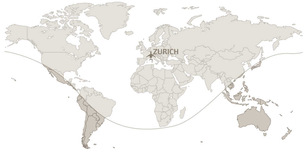
GLOBAL 5000 RANGE OUT OF ZURICH

This map is a schematic representation only.