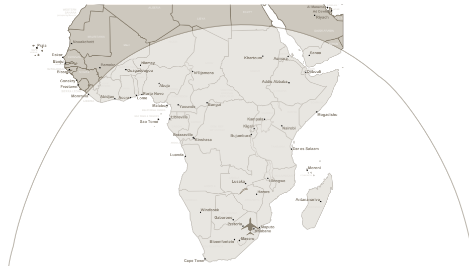
CHALLENGER 300 RANGE OUT OF LANSERIA

This map is a schematic representation only.