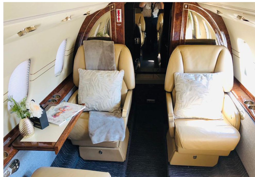
REFURBISHED IN 2010

This map is a schematic representation only.