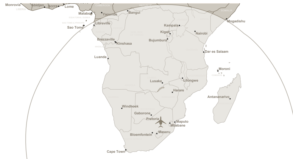
LEARJET 60 RANGE OUT OF LANSERIA

This map is a schematic representation only.