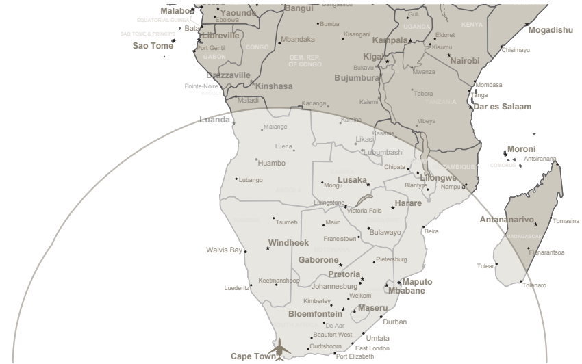
PILATUS PC-12 RANGE OUT OF CAPE TOWN

This map is a schematic representation only.