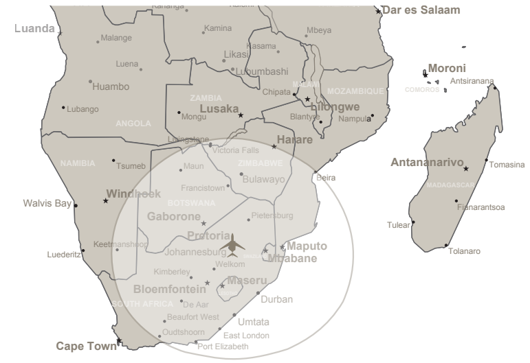
SUPERVAN 900 RANGE OUT OF LANSERIA

This map is a schematic representation only.