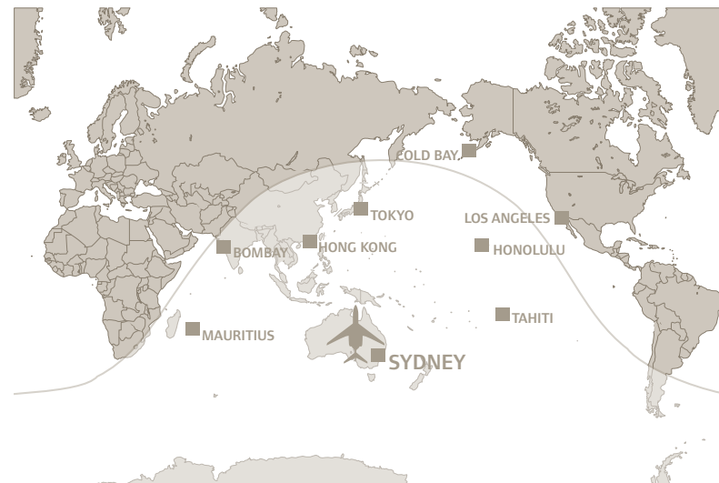
GLOBAL 6000 RANGE OUT OF SYDNEY

This map is a schematic representation only.