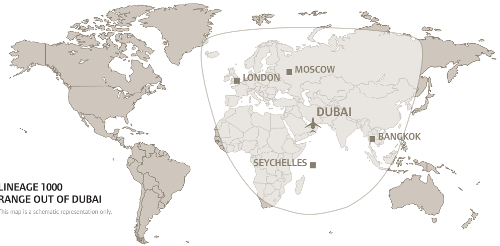
LINEAGE 1000 RANGE OUT OF DUBAI

This map is a schematic representation only.