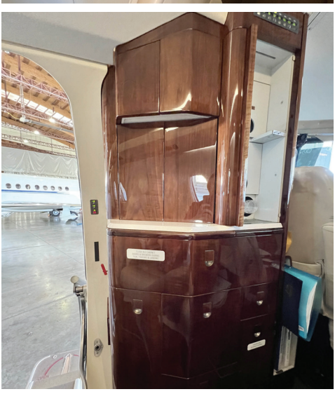
Your Aircraft Sales Team